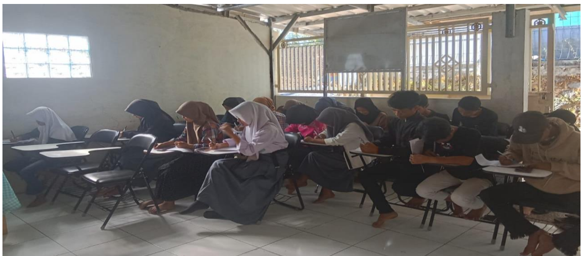
Figure 1. 2 Training Literacy and Numeracy on Packages High School Equivalent

Based on image above inhabitant Study seen enthusiastic in carry out training literacy and numeracy this , with preparation approaching implementation assessment held nationally simultaneously .