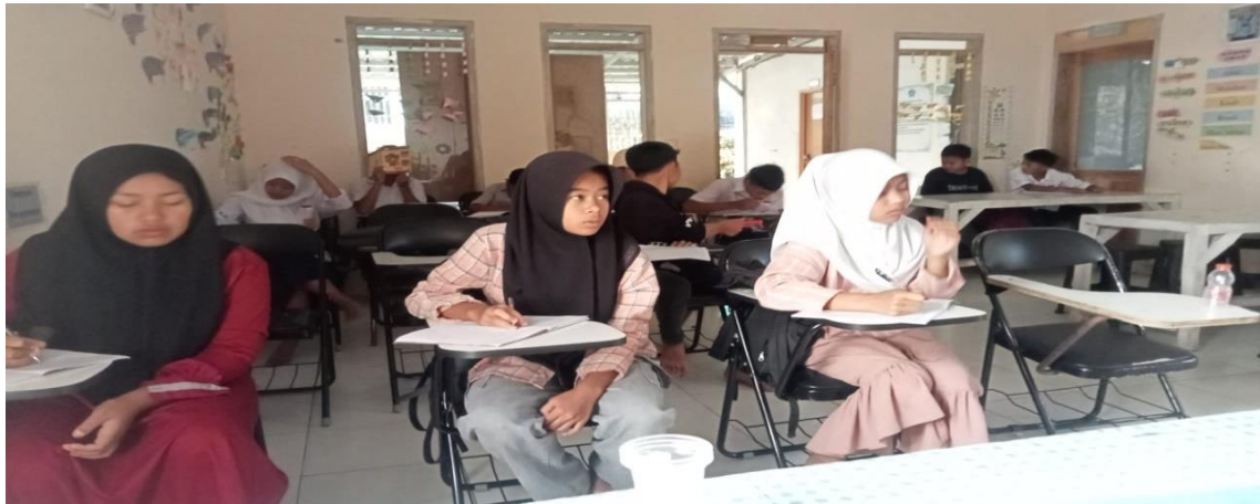
Figure 1. 1 Training Literacy and Numeracy on Packages Middle School Equivalent

(Package C) with amount inhabitant Study as many as 30 people. Place training implemented at PKBM Bina Warga Mekarjaya. As for implementation training literacy and numeracy can be seen in Figure 1.1 and Figure 1.2 below This .