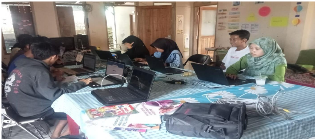
Figure 2.2 Training Literacy and Numeracy Based Computer Package High school equivalent