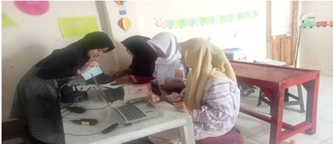
Figure 2.1 Training Literacy and Numeracy Based Computer Package Middle School Equivalent

Training literacy and numeracy with use room laboratory computer at PKBM Bina Warga Mekarjaya was implemented to inhabitant learn PKBM Community Development Mekarjaya can be seen in Figure 2.1 and Figure 2.2.